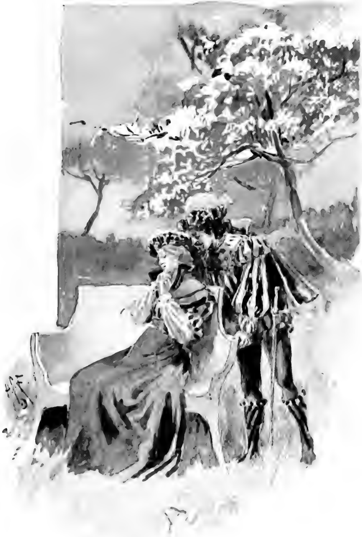
"WOO THE TIMID MAIDEN."—Page 61.